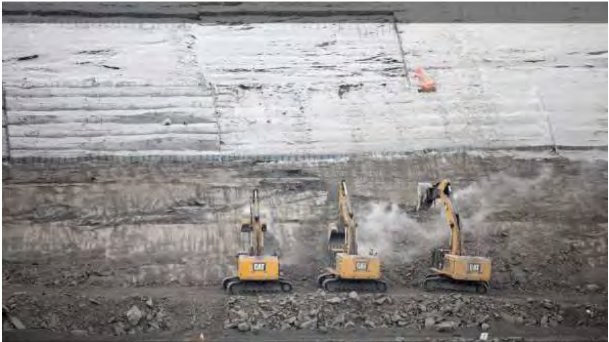
Figure A-6 Excavation continues on the foundation for the three concrete spillways on the south bank (February 2019)