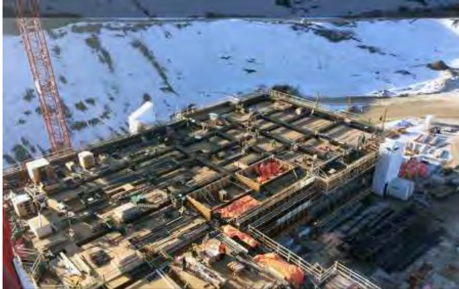
Figure A-3 General view of concrete placement at the main service bay (January 2019)