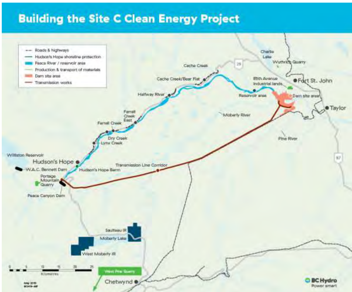
1 Figure 1 Site C Project Components

2 Significant Project updates that occurred between January 1, 2019 and 3 March 31, 2019, include: