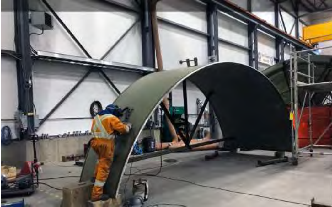
Figure A-1 A welder works on part of the spiral case in the on-site turbines and generators manufacturing facility (January 2019)