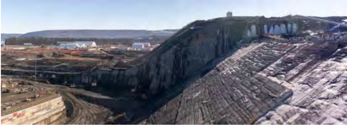
Figure A-10 Looking east over the spillway buttress excavation. Once excavation is complete, construction of the spillways buttress will commence. Site C will have two mechanical spillways and one auxiliary spillway, which will allow water to pass safely in the unlikely event of power loss (March 2019)