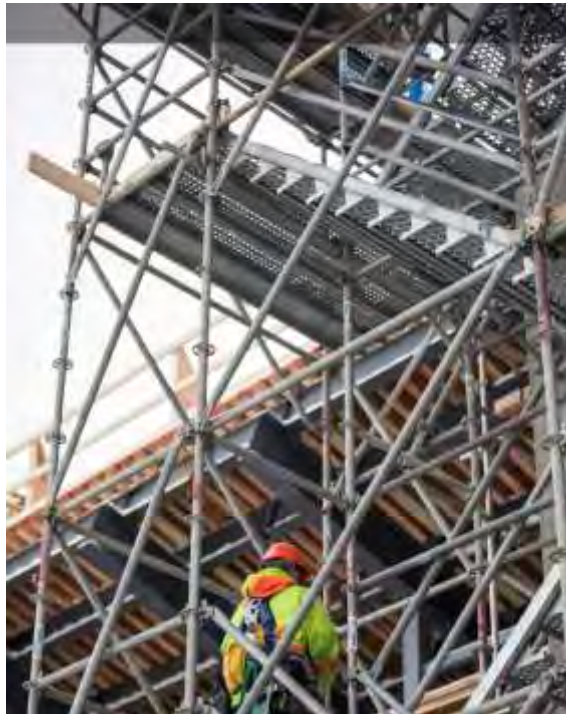
Figure A-4 Inspector reviewing and certifying that scaffolding is safe and complies with regulations. All parts of the Project are regularly monitored by environmental and safety inspectors (January 2019)