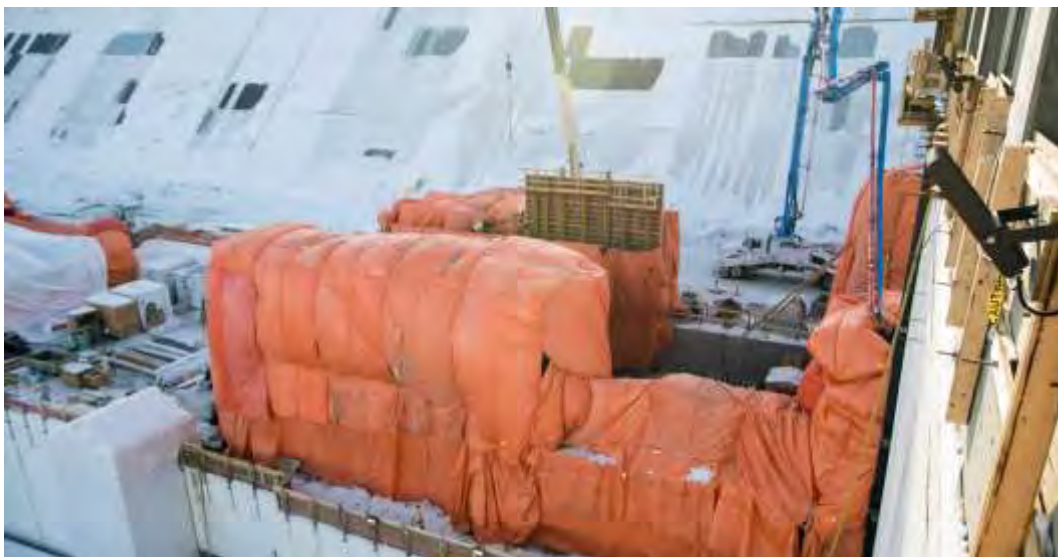
Figure A-2 Hoarding and heating protects concrete from the cold as it is placed at the generating station's double chamber walls (January 2019)