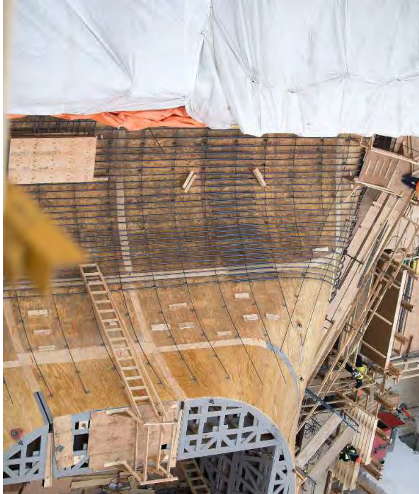
Figure A-7 A view of the unit #3 draft tube formwork (February 2019)