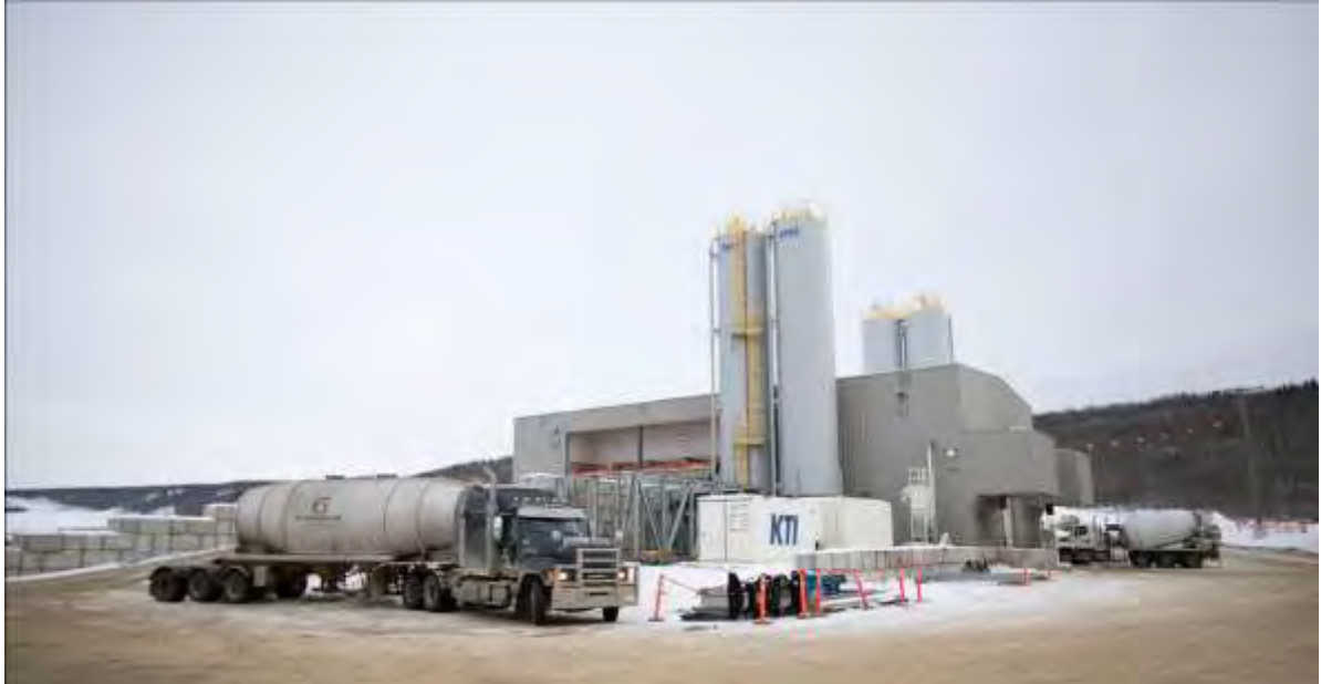
Figure A-5 On-Site Concrete batch plant is used to mix concrete for the generating station and spillways (February 2019)