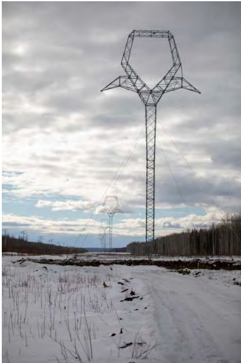
Figure A-8 As of March 31, 2019, 51 towers had been raised along the 75-kilometre-long transmission line corridor. In total, 405 towers will hold up two new 500 kV transmission lines, which will connect Site C power to the rest of BC Hydro's grid (February 2019)