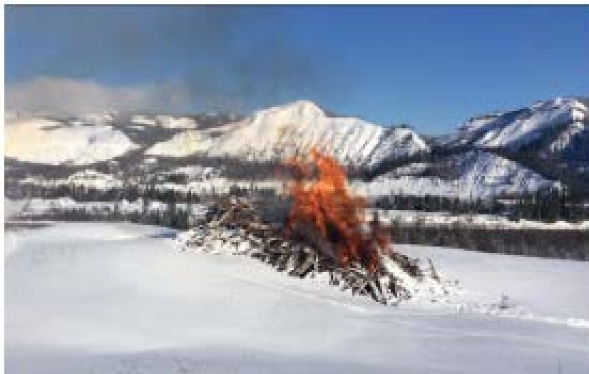
Before and After: Waste wood pile burning