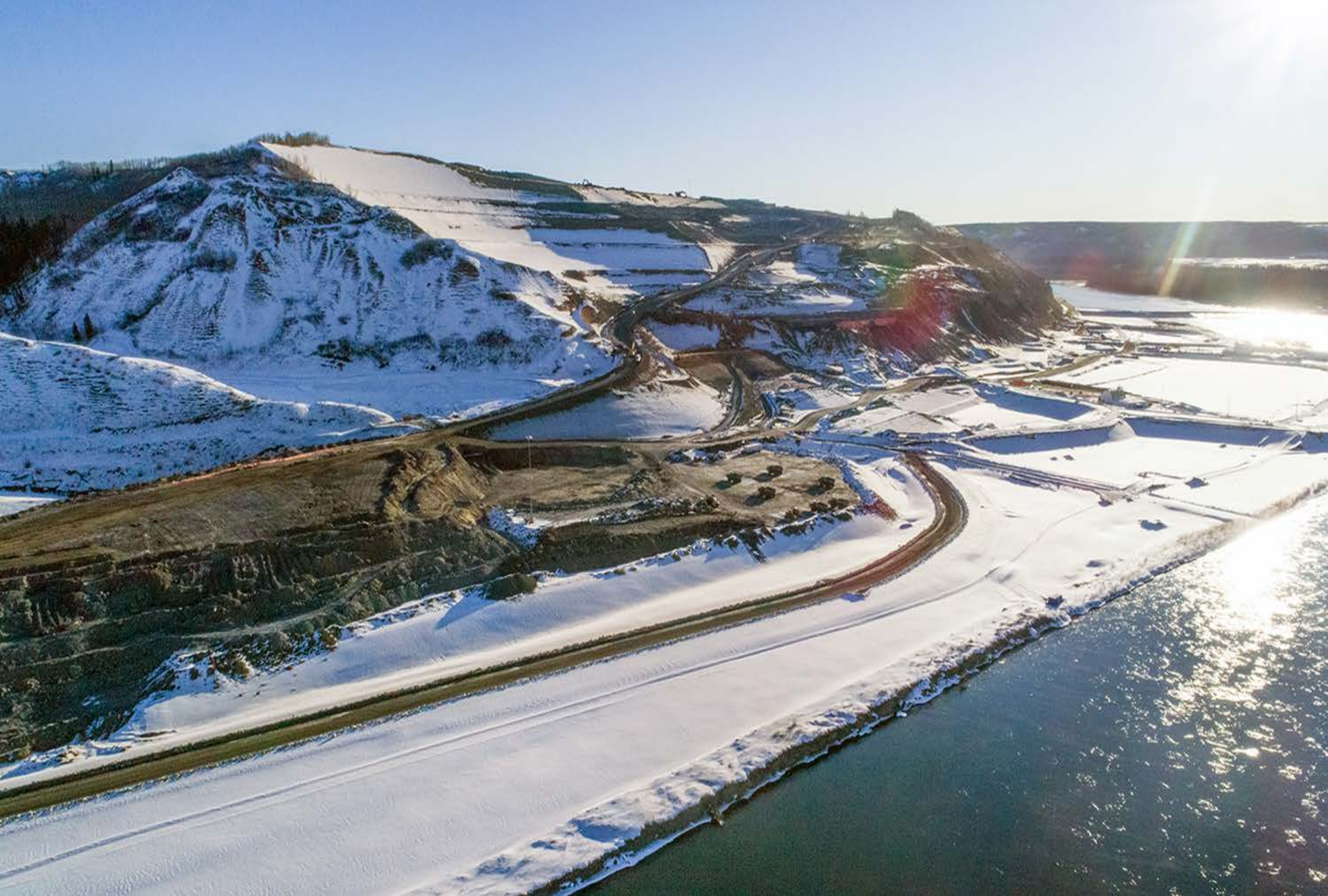
North bank excavation