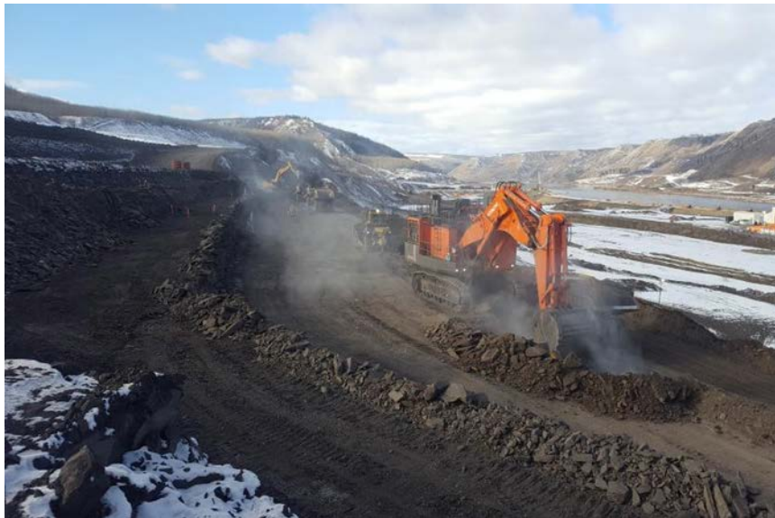
Excavation of Powerhouse February 2017