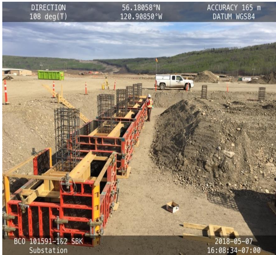
Control building foundation