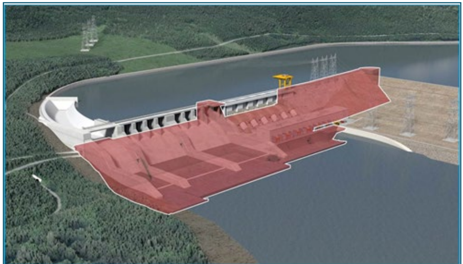
The south valley wall under the dam, the generating station and ancillary structures, and the spillways will be reinforced with a long concrete buttress to improve foundation stability and seismic protection.