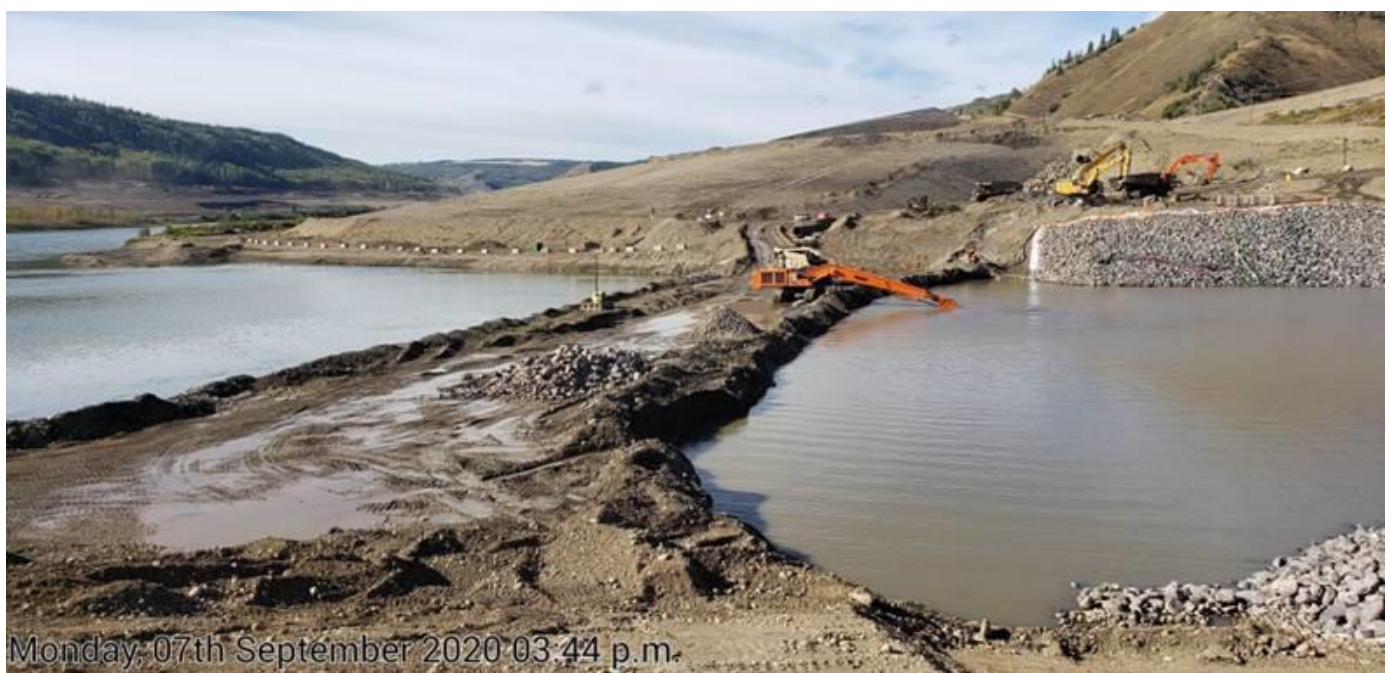
A long boom excavator placing rock armouring on the inlet channel

Our construction teams are removing portions of the inlet and outlet cofferdams, and armouring the approach channels with rock. This is done with specialized excavators that have long booms which allow them to reach up to 75 feet.