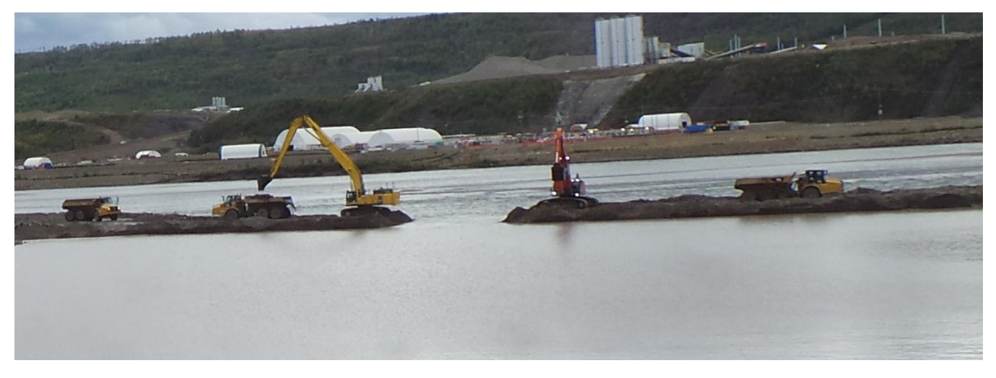
September 11, 2020 – Excavators removing material to open the cofferdam on the outlet channel.

Two long boom excavators working together (one removing material, one placing rock) on the outlet channel.