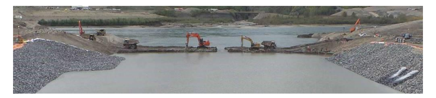
September 11, 2020 – Excavators removing material to open the cofferdam on the inlet channel.

With river flows dropped, our construction crews are continuing their encroachment into the river on the inriver stage 2 cofferdams.