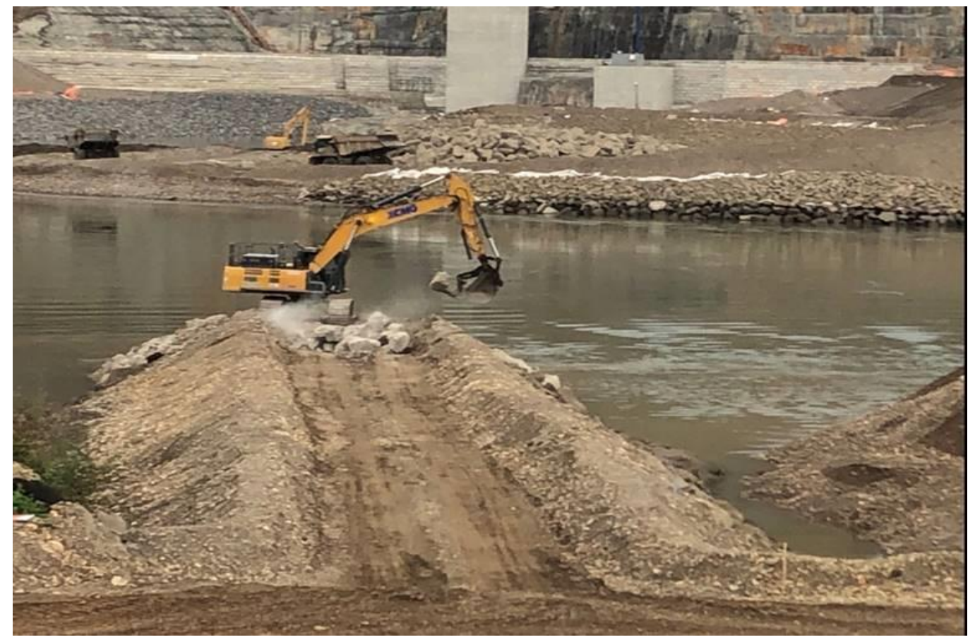
Rockberm encroachment continuing to 35 per cent.

With river flows dropped, our construction crews are continuing their encroachment into the river on the inriver stage 2 cofferdams.