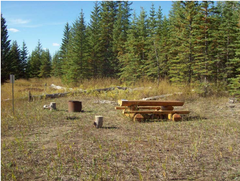
Photo 69. Curl Camp campsite.

Comments: Posted with signage indicating name of the site and GPS coordinates.