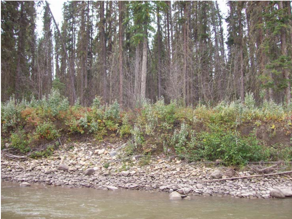
Photo 42. Unmaintained Campsite F.

Potential hazards to users: Boating is difficult in summer low water levels.