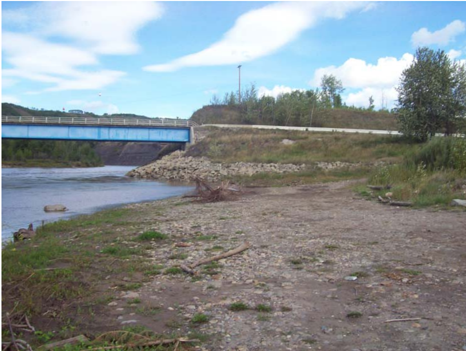
Photo 37. Halfway River Bridge boat launch.

Comments: Several homemade fire pits and large cleared areas for camping present on both sides of the bridge.