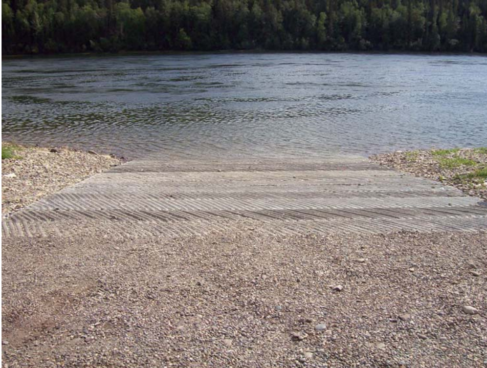
Photo 14. Lynx Creek Boat Launch.