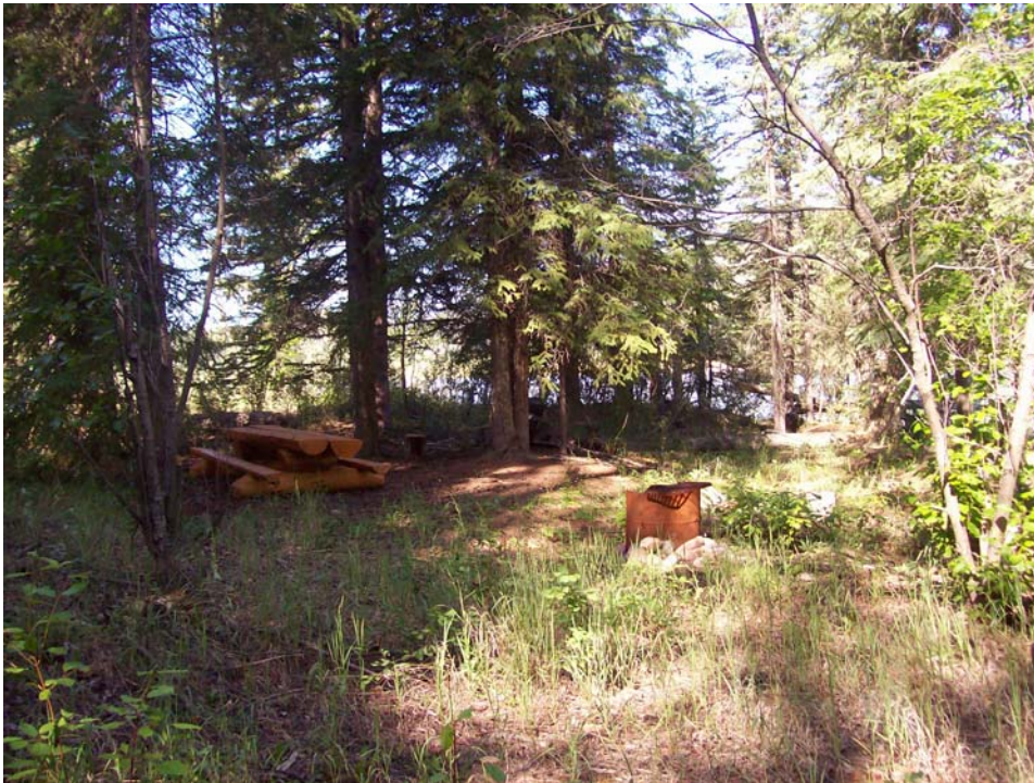
Photo 56. Primitive Maintained Campsite A.

Comments: Unlike all other primitive maintained campsites described in this report, this site was not named either with posted signage or on the River Rats site map.