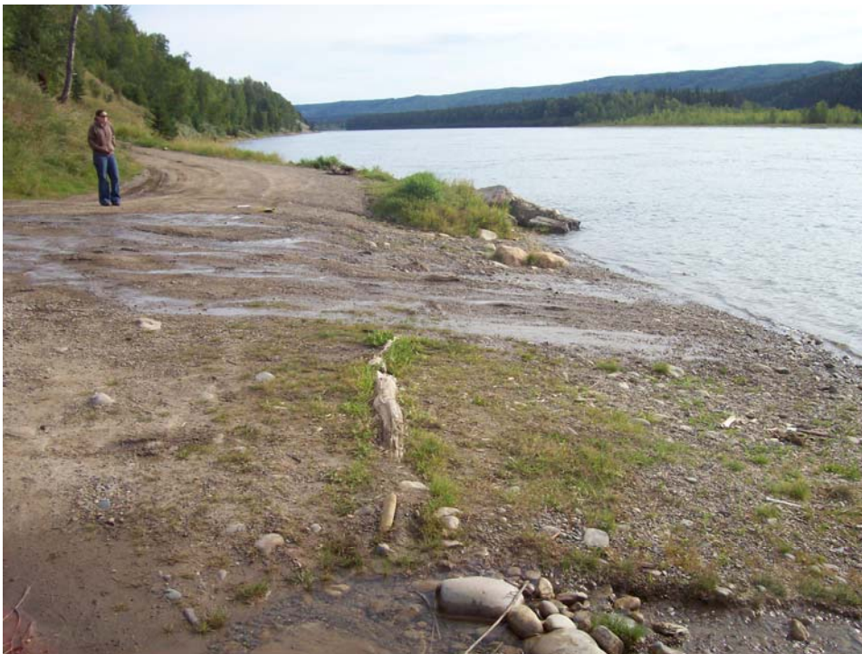
Photo 13. Hudson's Hope boat launch.