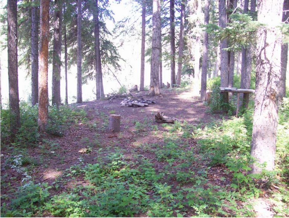
Photo 100. Unmaintained Campsite K.