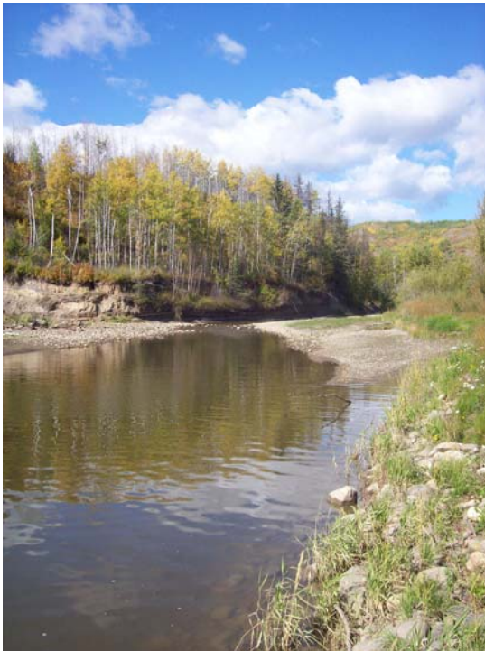
Photo 31. Farrell Creek confluence shoreline access.

Potential hazards to users : If entering Farrell Creek at the bridge (to walk to confluence) rip rapped bank poses dangerous footing.