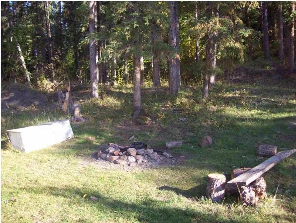
Photo 61. Unmaintained Campsite H.