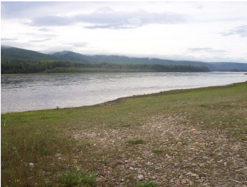
Photo 35. Drive-in shoreline access at Unmaintained Campsite E.

Comments: The shoreline access at this site may be used as a boat launch but very unlikely given the rough condition of the access road (potential for boats and trailers to suffer damage).