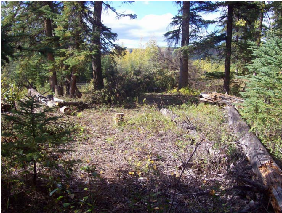
Photo 27. Potential area for setting up tents at Unmaintained Campsite C.

Potential hazards to users: Potential windfall trees.