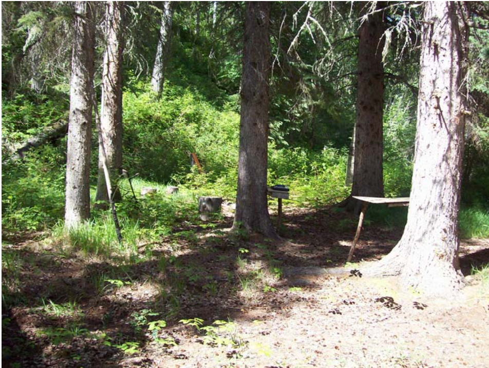
Photo 106. Unmaintained Campsite L.