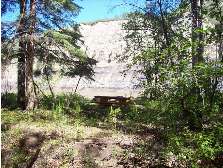
Photo 85. Swimming Hole camp site with view of shale cliffs across the Pine River.

Comments : Posted with signage indicating name of the site and GPS coordinates.