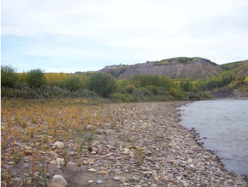
Photo 41. Shoreline Access B on the Halfway River.

Potential hazards to users: Boating is difficult in summer low water levels.