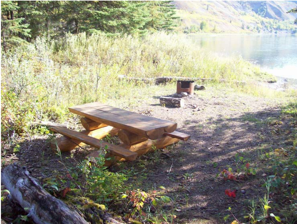
Photo 58. Eagle Nest campsite.

Comments: Posted with signage indicating name of the site and GPS coordinates.