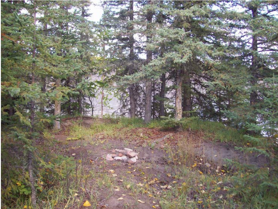
Photo 29. Unmaintained Campsite D.

Potential hazards to users: Bank trail is treacherous footing.