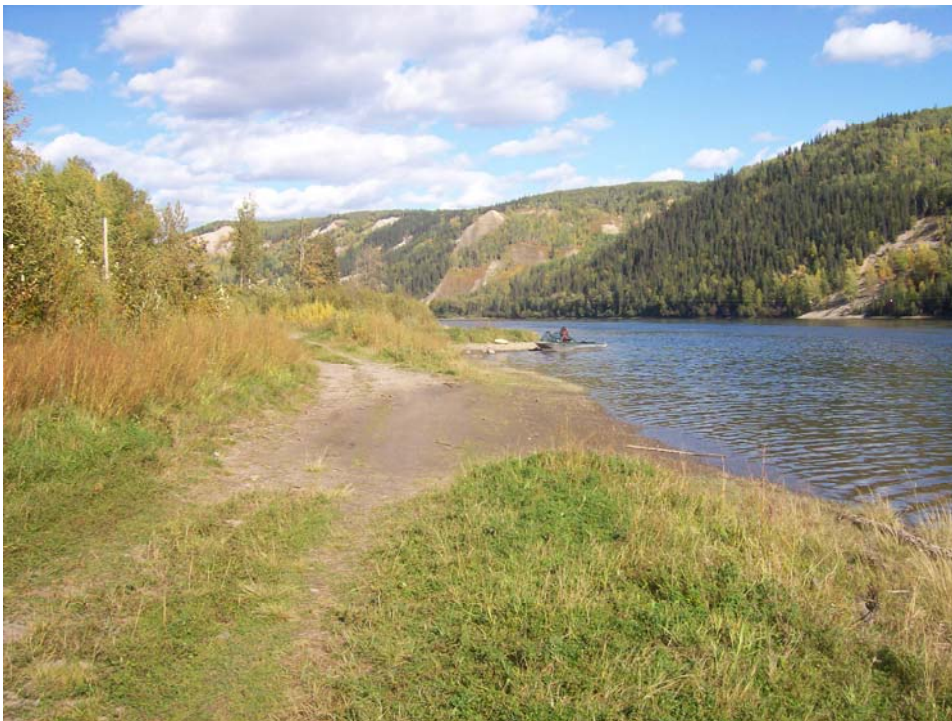
Photo 15. Shoreline Access A.

Comments : Homemade fire pits and bench on site.