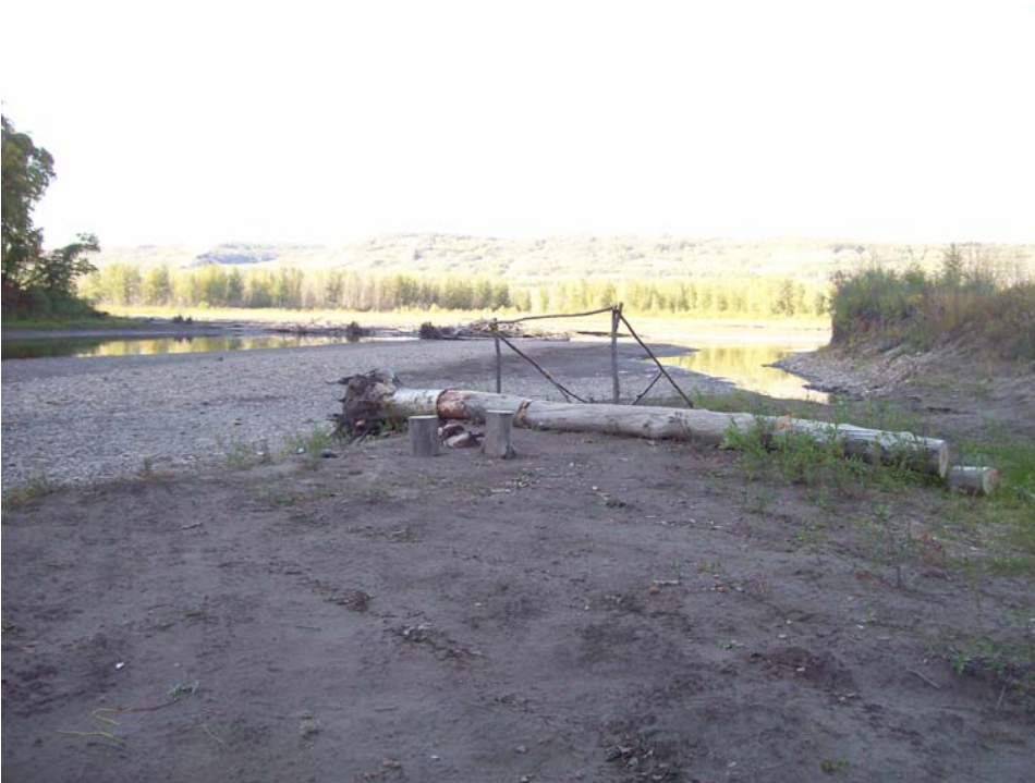
Photo 75. Kiskatinaw River shoreline (confluence of Kiskatinaw River view).

Comments: Homemade fire pits and all terrain vehicle tracks present.