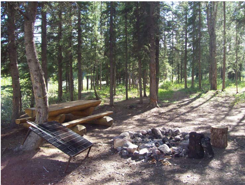
Photo 101. Happy Hour Corner campsite.

Comments: Posted with signage indicating name of the site and GPS coordinates.