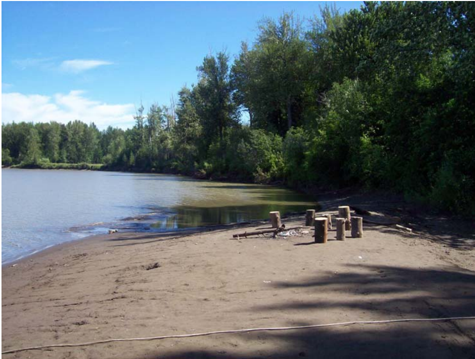
Photo 82. Shoreline access D.