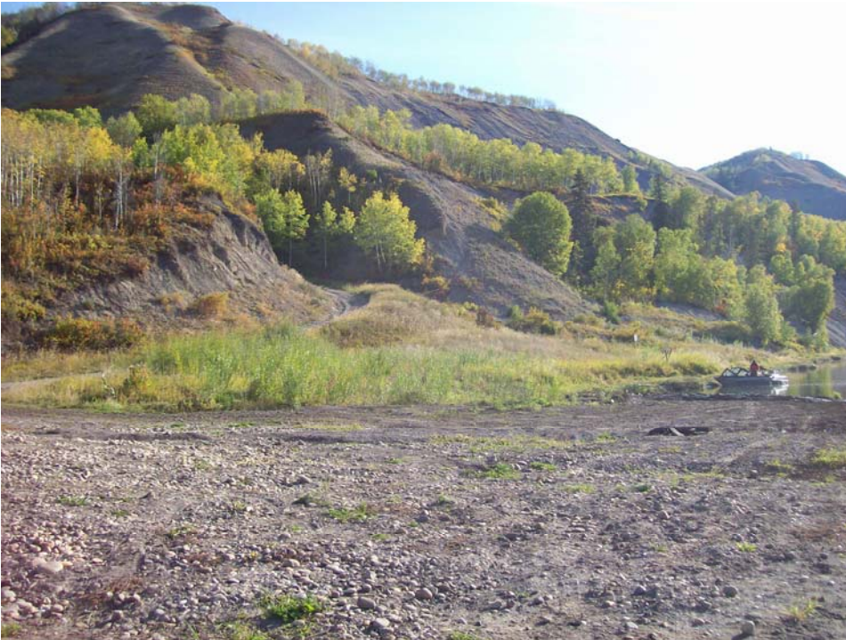
Photo 60. Shoreline Access C.