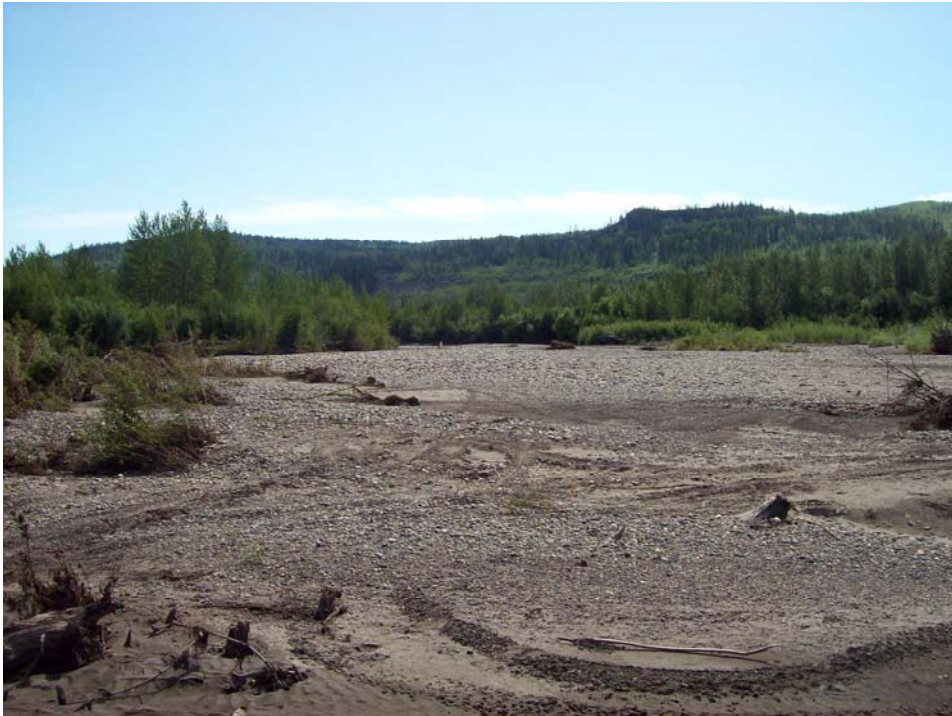
Photo 83. Island area of Shoreline access E.

Comments: Homemade fire pits and all terrain vehicle tracks present.