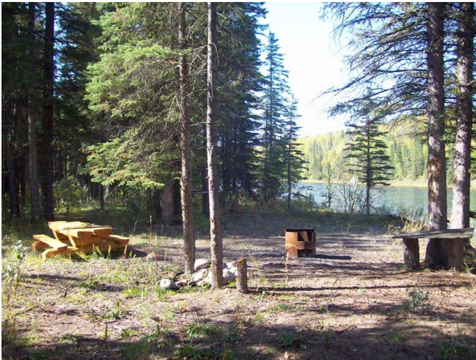
Photo 33. Hawk Island campsite with amenities.