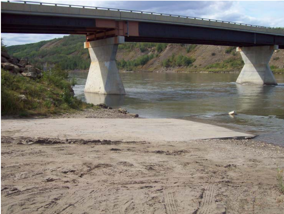
Photo 77. Blackfoot Park boat launch.

Comments: Annual usage is not recorded at Blackfoot Park.