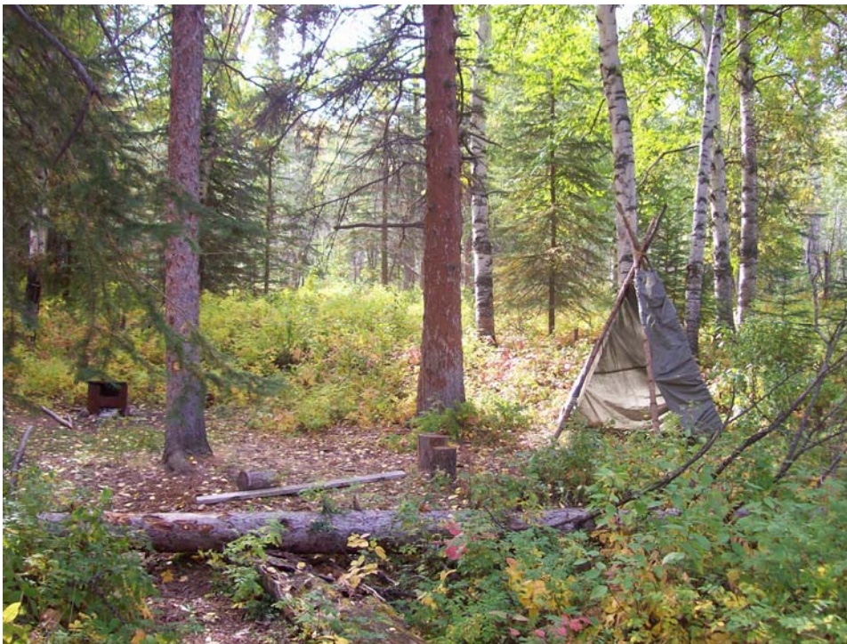
Photo 63. Birch Camp campsite.

Comments: Posted with signage indicating name of the site and GPS coordinates.