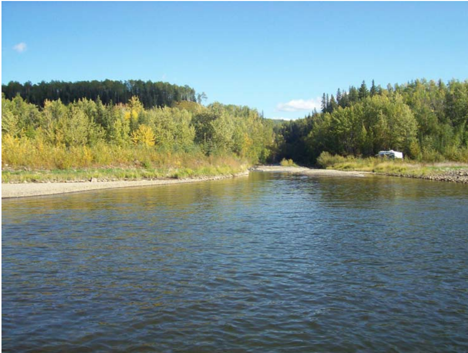
Photo 12. Maurice Creek confluence shoreline access.

Potential hazards to users: Access road often in poor condition.