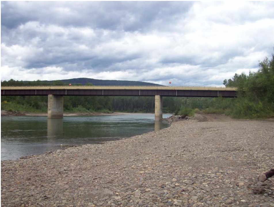
Photo 109. Twidwell Bend North bank shoreline access.

Comments: Site occurs on both banks of the Pine River, vehicles may park on exposed gravel bars on both sides. Swimming is known to occur regularly at the third access point (South bank secondary access). Homemade fire pits and ATV tracks present on site.